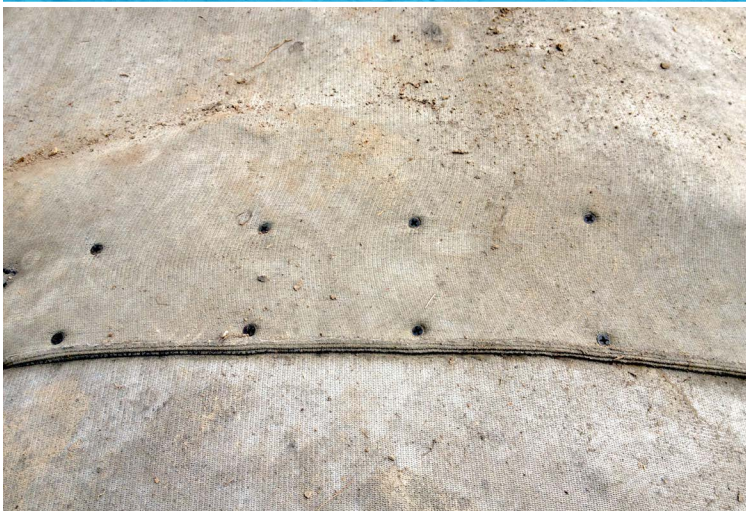
CC overlaps double screwed at 120mm intervals