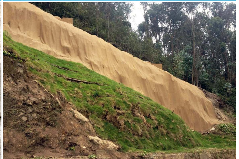
The finished, painted slope