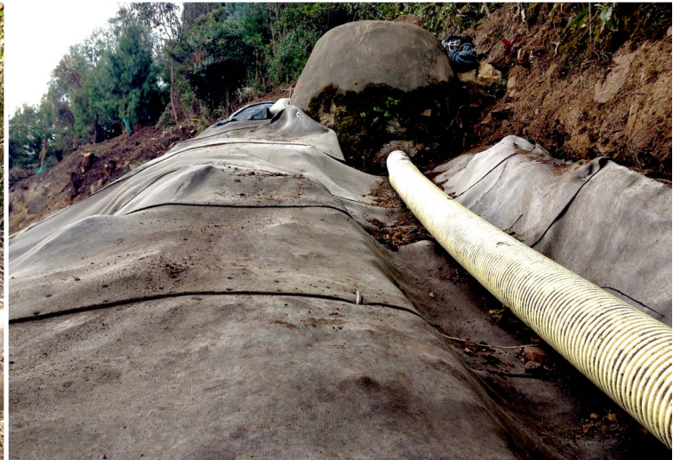
CC secured at top of slope with anchor trench and ground pegs