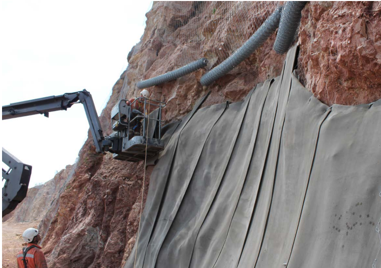
CC8™ hung from top of rock face using 250mm steel ground pegs