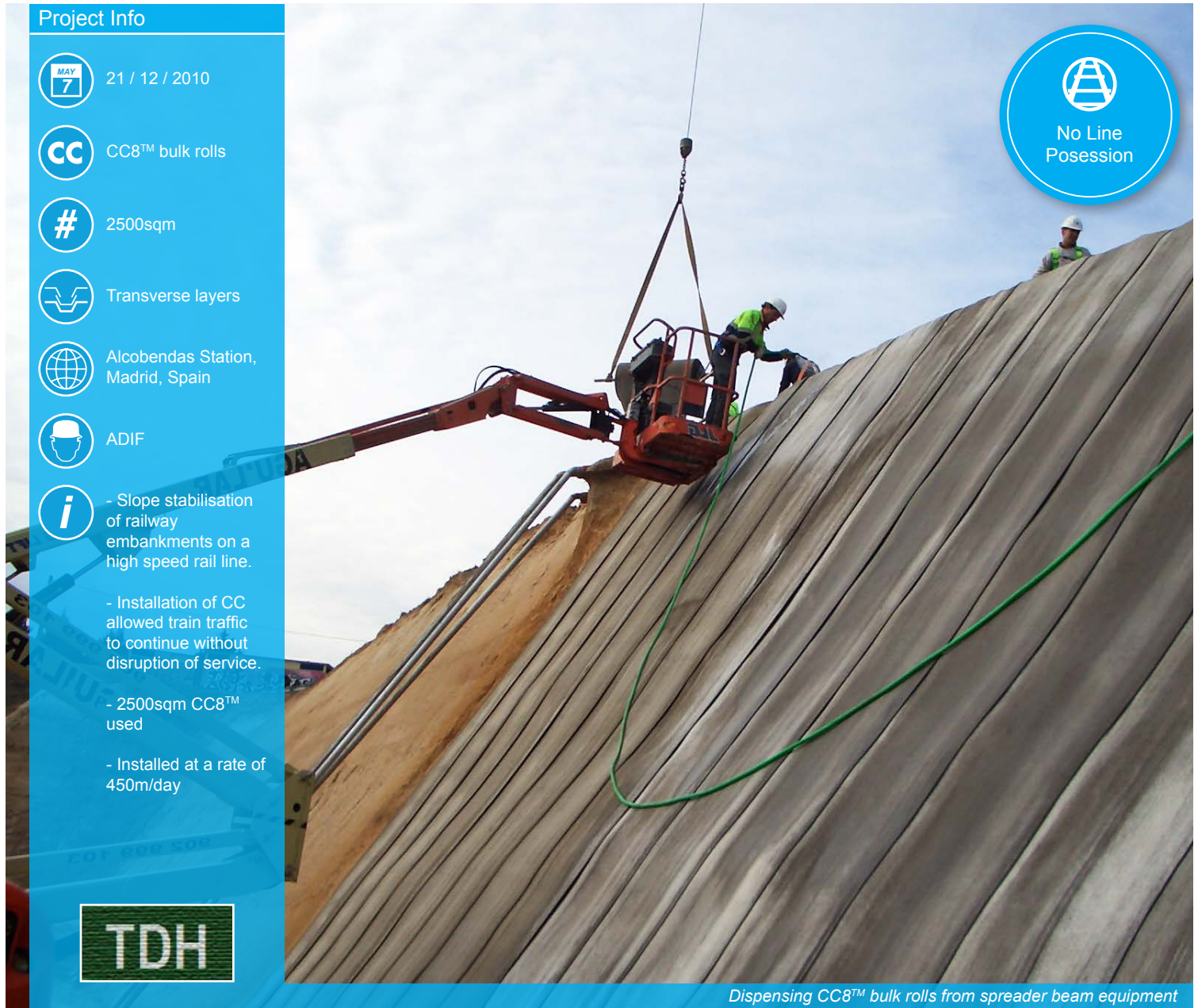
Dispensing CC8™ bulk rolls from spreader beam equipment

In December 2010, ADIF, the Spanish authority responsible for railway infrastructure management, specified Concrete Canvas® GCCM* (CC) to be used as slope protection for a railway station in Madrid. CC was chosen to address years of erosion and instability issues affecting the entrance of Alcobendas tunnel station. Erosion of the steep railway slope embankments had caused silting at the drainage pumps in the tunnel entrance. Shotcrete had been used twice previously but presented several problems with installation and durability.