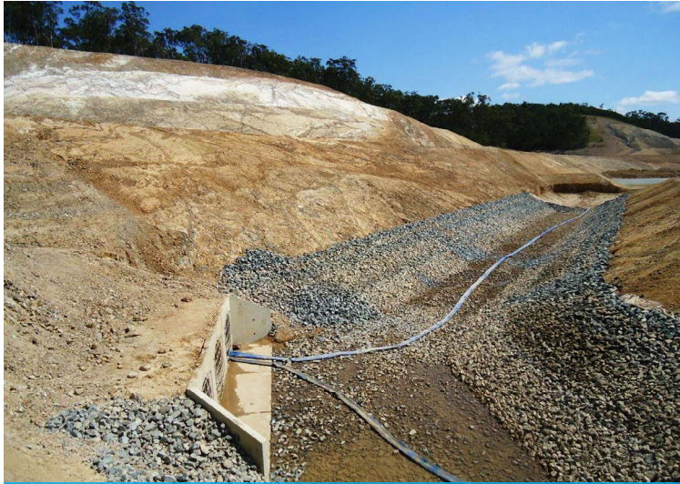
Ground conditions before installation