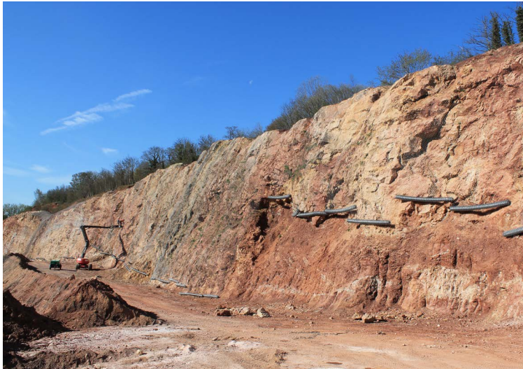
The installation site was suffering from severe surface erosion