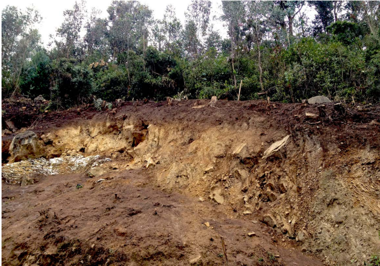
Project site before CC installation