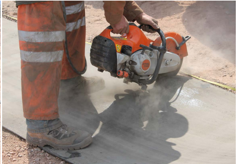
Unset CC8™ cut to length using a disk cutter