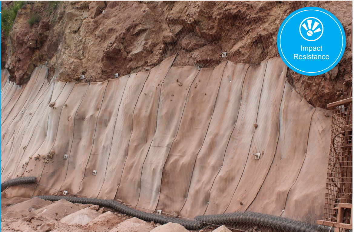
Completed section of slope lined with CC5™

CC trialled as an alternative to shotcrete in providing surface erosion protection to sandstone.