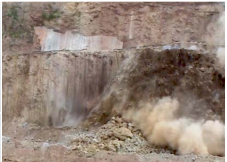
CC surviving the blast unscathed