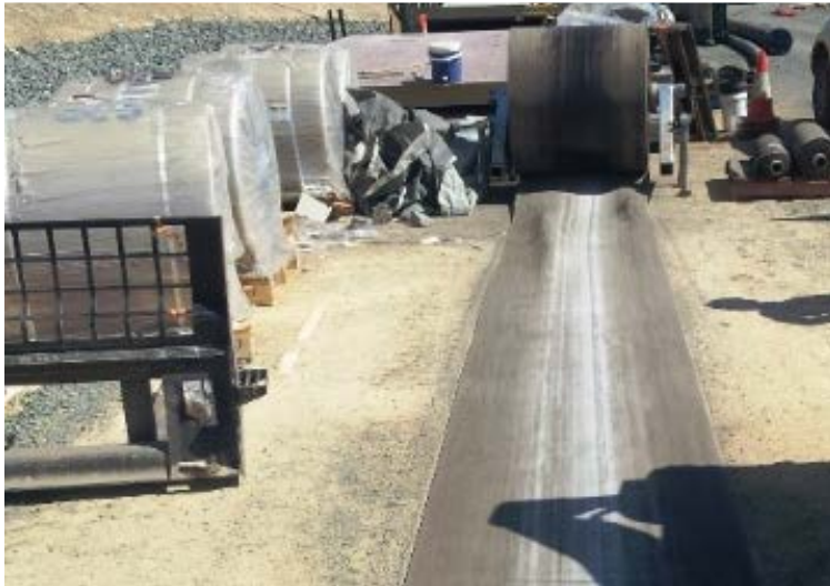
CC bulk rolls