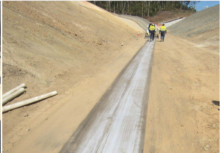
Unrolling the CC with plant