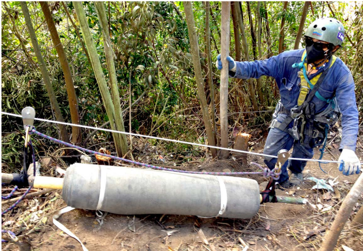
Pre-cut 12 linear metre lengths of CC on rope mounted spreader beam