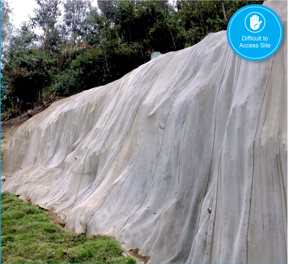
Completed CC lined slope

In October 2012, Concrete Canvas® GCCM* (CC) was specified as a hard armour surface coating to prevent further weathering erosion of a roadside embankment in Cundinamarca, Colombia. The slope had degraded to the point that traffic on the nearby road was at risk from falling rock and debris. Shotcrete or mortar slab had originally been considered for the project, but CC was chosen due to its speed and ease of installation, homogeneity and consistency compared to shotcrete. It also allowed greater flexibility in terms of site access, as the installation team were unable to use heavy plant at the crest of the slope.