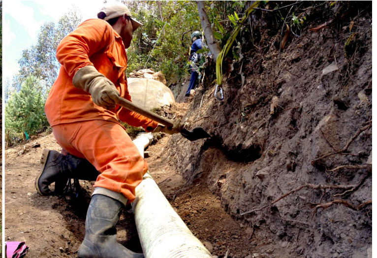
Site preparation including removal of vegetation and loose substrate